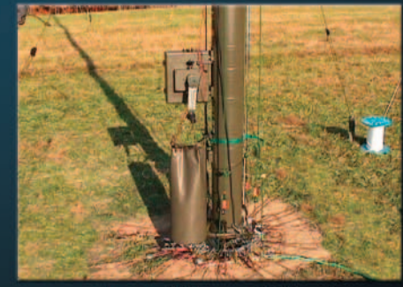
Base View of Mast