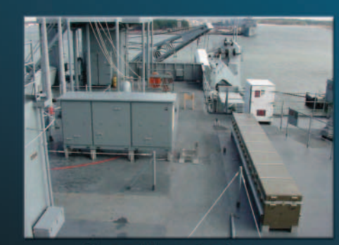
Case Mounted on Ship Deck