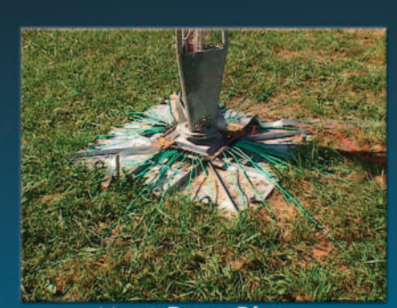
Mast Base Plate (No Concrete Required)