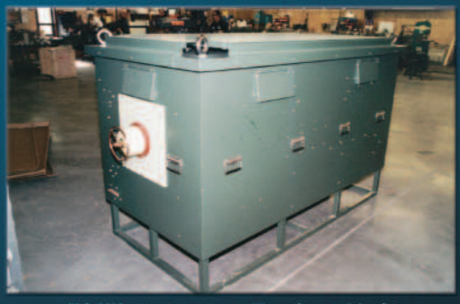
5kW Antenna Tuning Unit (Available for transmitter power rating of 1, 5, 10 or 50 kW)