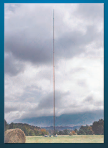
LAND-BASED ALL-BAND LONG RANGE

Kintronic Labs offers complete concept to field tested mobile antenna systems built to the customer's specific requirements.