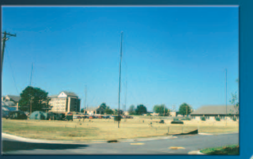
LAND-BASED ALL-BAND SHORT RANGE