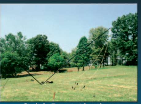
Quick Erect Aluminum Sectionalized Supports