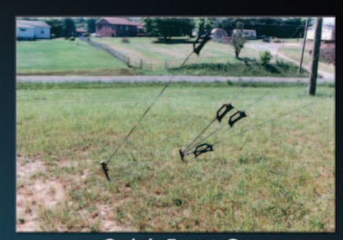
Quick Erect Guy Tensioning Devices