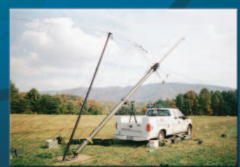
Quick Erect Crank-up Composite Mast