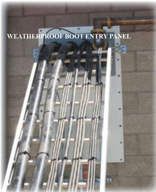
WEATHERPROOF BOOT ENTRY PANEL

FOR INSTALLATION AT RADIO BROADCAST TRANSMITTING SITES OR WIRELESS TELECOMMUNICATIONS TOWER SITES