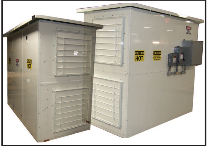
MODEL # DL-100WP-2X OUTDOOR