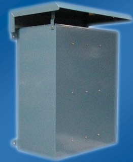
TYPICAL AM/MW WEATHERPROOF AIR COOLED DUMMY LOAD